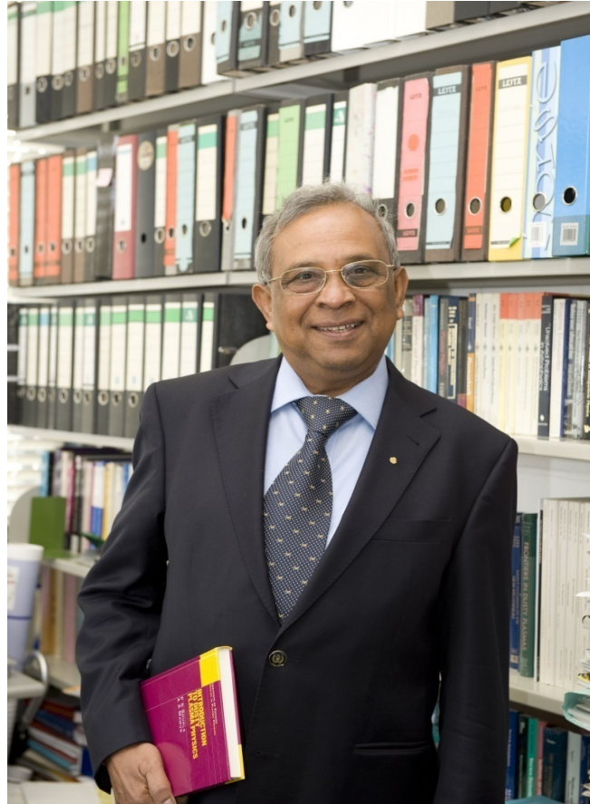
Padma Kant Shukla 1950 – 2013 (India-Germany)